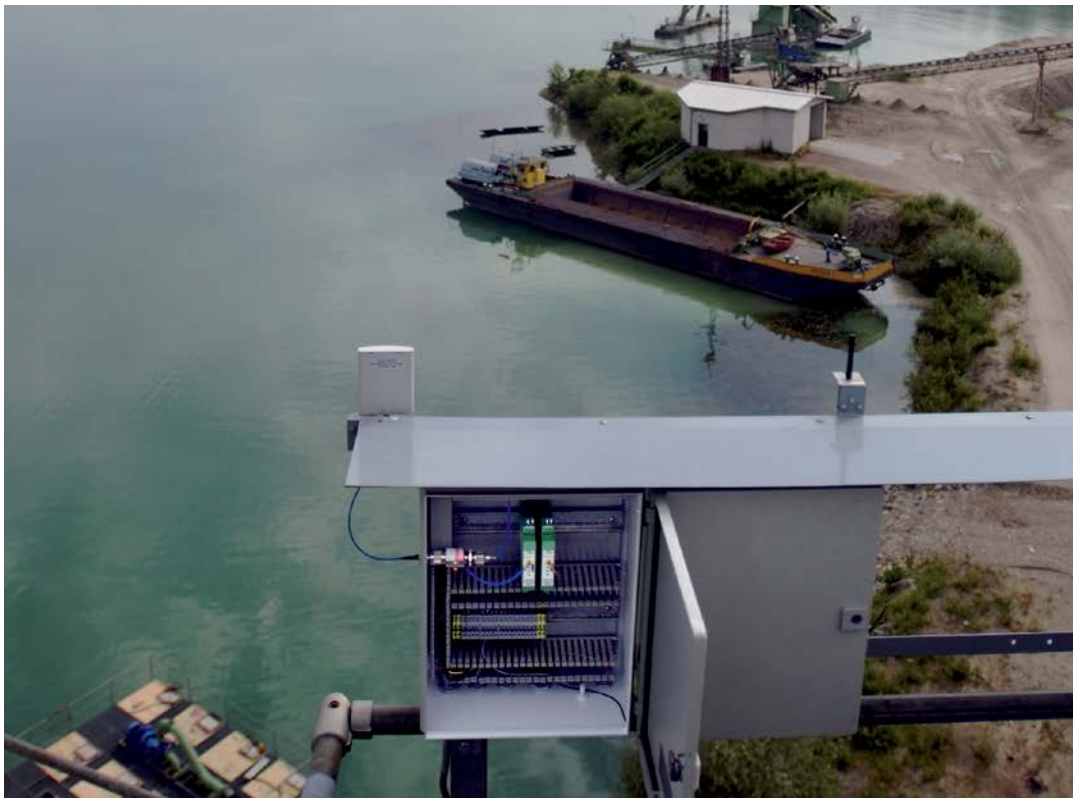
Figure 5 Wireless in practice

With visual contact, it is possible to transmit over a distance of up to 5.5 kilometers, e.g., when networking well fields. In the event of failure, a new communication path is selected and data transfer is still ensured. 255 devices can be connected per network. Multiple networks can be operated in parallel without any restrictions.