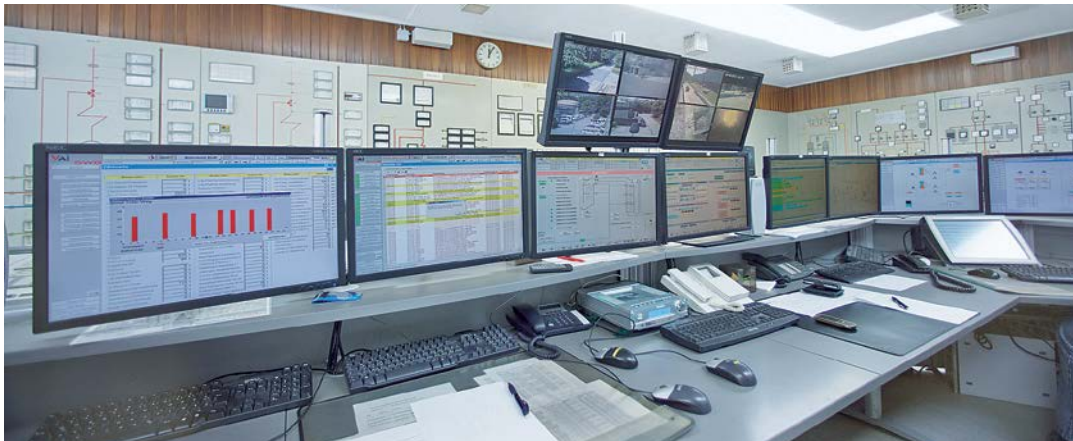
Figure 1 Control room

Remote control technology describes the remote monitoring and control of physically separate system parts by means of data transmission. Measured values and control commands are transmitted over long distances and visualized, processed, and stored in a control center. In contrast to remote maintenance, remote control requires a permanent connection to a remote station in the vast majority of cases.