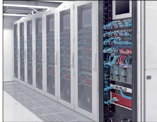
Figure 4 Server room

When a proprietary data line is used for the remote control technology connection, e.g., in the power supply network of municipal works, it should be noted that if the copper cable is longer than 1.5 kilometers, the signals to be transmitted must be modulated in order to increase the range. Whether based on copper cables or fiber optics, this means that process information can be exchanged with a central control system over long distances.