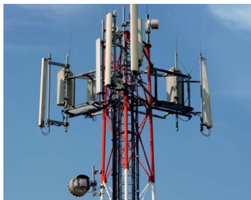
Figure 2 Mobile phone tower

If no proprietary cables are present, communication via a TCP protocol for networking distributed systems to the control system is a reliable method for data transmission. Protocols according to IEC 60870-5-104 or IEEE 1815 (DNP3) support standardized connections for stormwater overflow tanks, pumping stations or well shafts – via the mobile communication network or wired communication depending on the application. If such interfaces already exist at the control system, the remote control devices used can reliably communicate with the control system. Depending on the protocol used, communication is event-oriented and prepared for the use of GPRS-based hardware. In the event of the failure of the communication infrastructure, the remote control protocol ensures that data is stored.