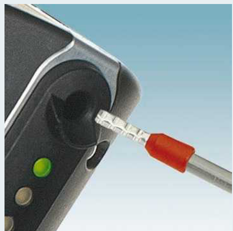
...and you're done!