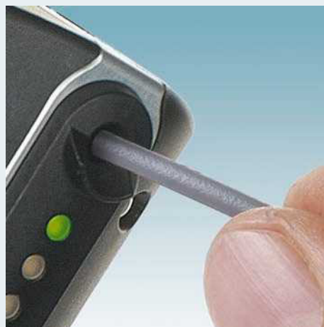
... stripping and crimping is carried out automatically ...