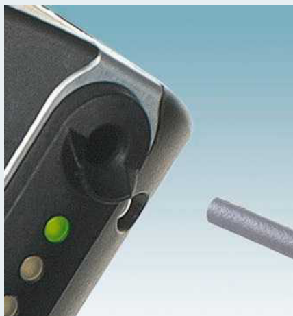
Simply insert the conductor, ...