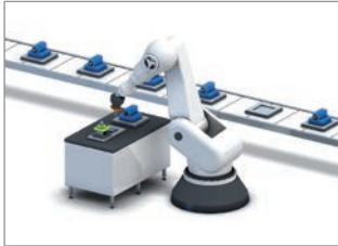
Robotics and Tool Changing